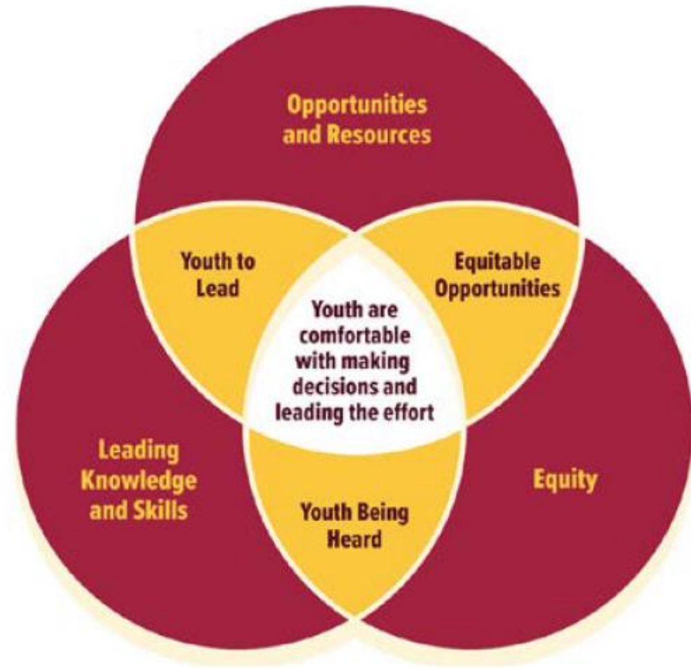
Framework for Youth Voice, Engagement, and Leadership in Community Schools